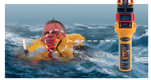
ns The ATB1 will relay MOB1 transmissions to your AIS Alarm or plotter