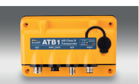
Micro USB connection located under rubber seal on top of ATB1

A leader in life-saving maritime products for the professional and leisure markets, Ocean Signal yet again provides the ultimate in safety and peace of mind with the ATB1 Class B Transponder.